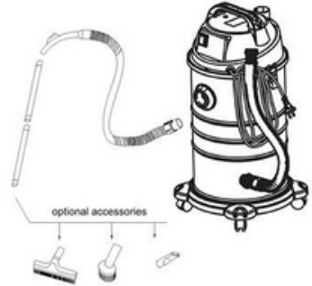
Wet / Dry Mode Set-Up