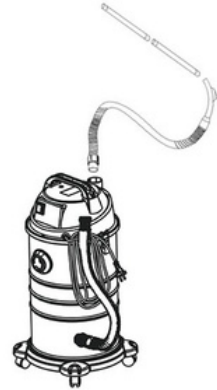
Blower Mode Set-Up

You can adjust the air flow by pushing the slider block up and down on the hose handle.